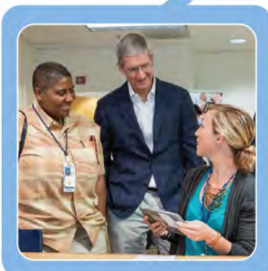
Tim Cook CEO Apple Palo Alto, CA

"Honored to meet doctors and Veterans now using [mobile devices] to help treat Vets and families."